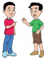
Standing up for self