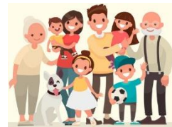
Families and their differences