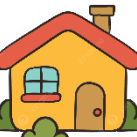
Where we live