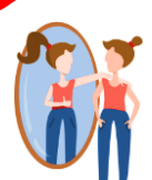
Accepting self / others