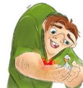
Judging by appearance