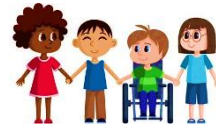
Similarities / differences